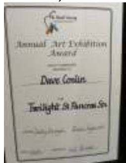
Dave Conlin "Twilight, St. Pancras Station"