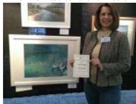
Pascale Doumerc "Boats on a Lake"