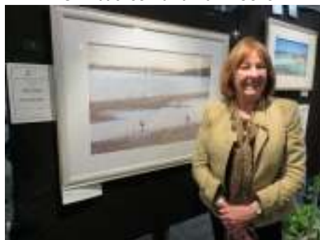
Rayma Reany "Lakes at Last Light"